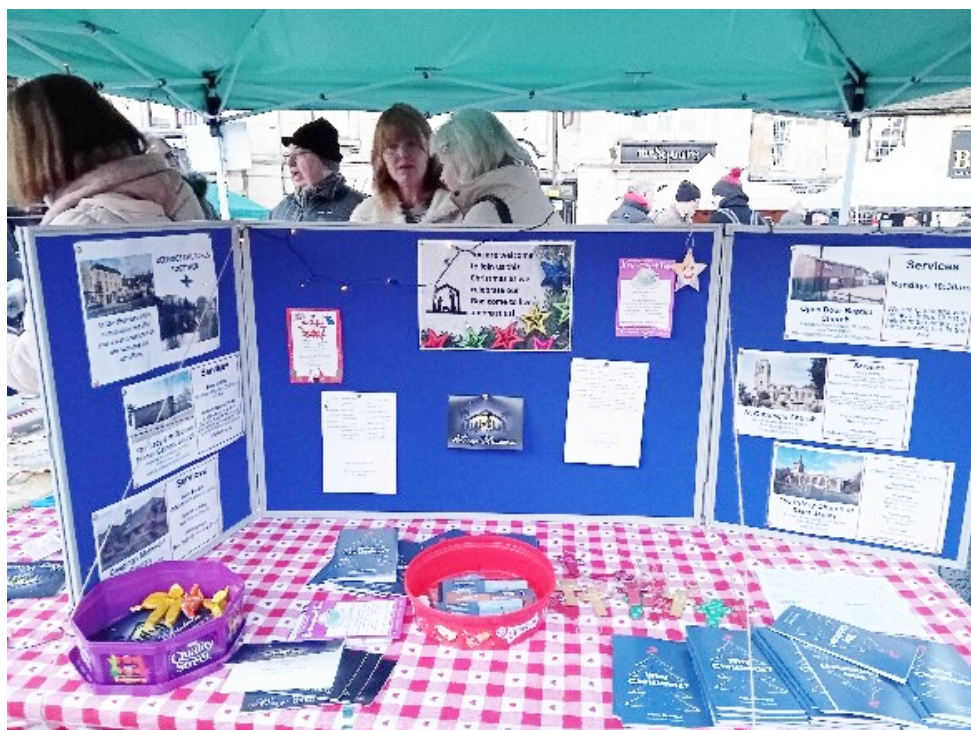
The Churches Together stall at the Christmas market, and two church arrangements