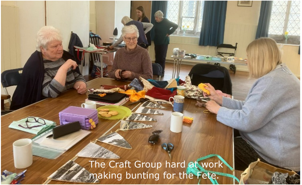
The Craft Group hard at work making bunting for the Fete.